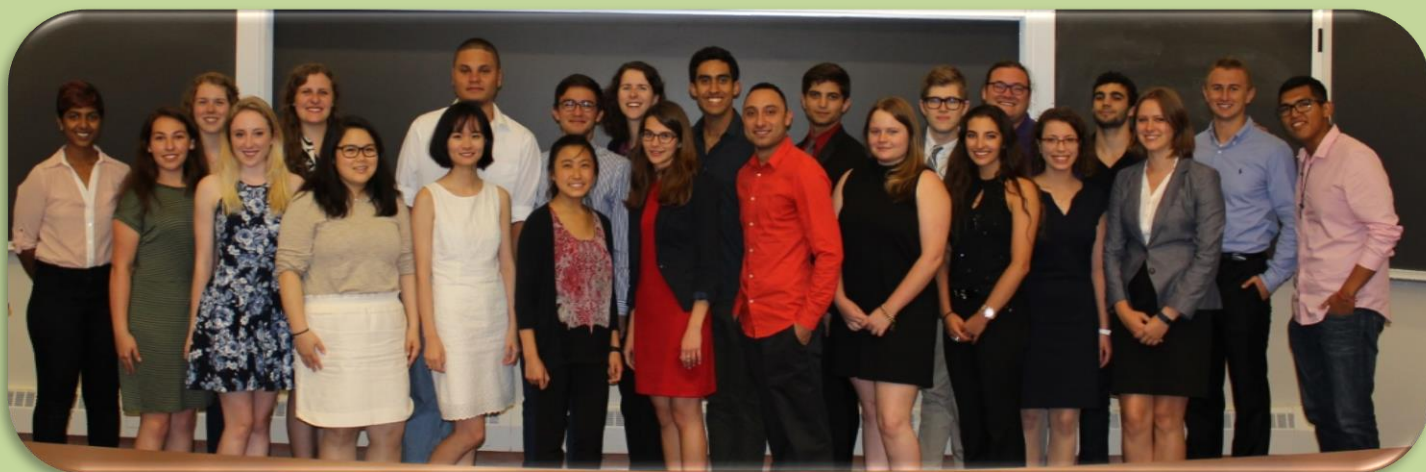
REU Class of 2016

Apply online at www.mrsec.northwestern.edu